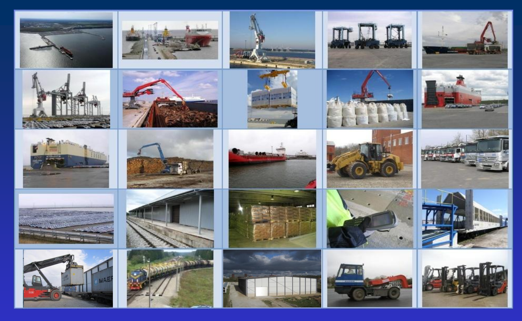
SILSTEVE, Port of Sillamäe

SERVING CARGO FLOWS BETWEEN RUSSIA AND THE CIS AND THE REST OF THE WORLD